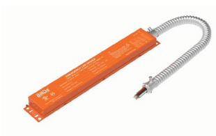
EB-12W90M-ACV2 90min Emergency Battery Backup

Output Power: 12W (initial) Emergency Operation: 90 minutes Battery Type: nickel-cadmium Input Voltage: 120-277 VAC Output Voltage: 20-50 VDC Class 2 Output: Yes Diagnostic Type: Remote Control testing Life Expectancy: 7-10 years Mounting Type: Remote Inline (metal conduit) Maximum Distance: 25 ft